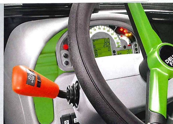
Hydraulic Powershuttle available on request.