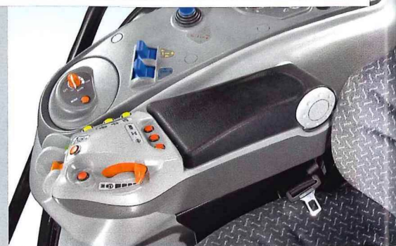
The armrest allows the control all the main functions of the Agrofarm TTV.

With a three-stage Powershift transmission or the new infinitely variable TTV transmission as an option the Agrofarm Profiline, with its two models the 420 and 430, is the ideal compact solution for all farmers who place a little extra value on features and comfort.