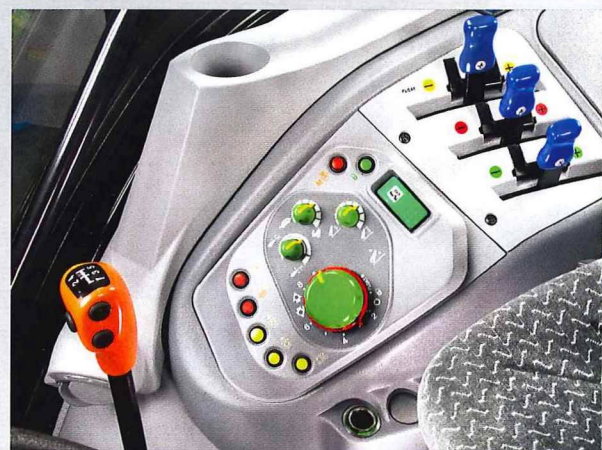
Neatly arranged control levers in the right console.