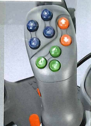
The PowerComS control lever to control the major tractor functions.