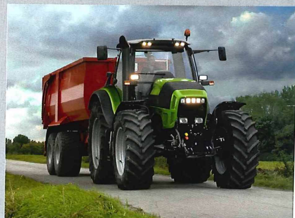
Agtron L – efficient in every situation.