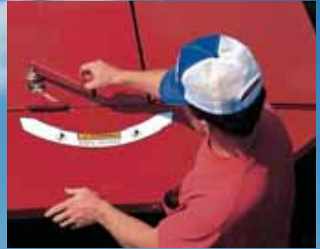
A simple turn of a hand crank lets you raise the conditioning hood away from the flails for lighter conditioning. Lower the hood for more aggressive action in grass. (Model 1412 shown)

All Discbine® models feature fast and easy windrow shield adjustment, all without tools. Depending on crop and moisture conditions and your method of final harvesting, you can spread the cut crop in a fast-drying swath as wide as eight feet (depending on model) to a tight, three-foot windrow that's ready to bale or chop.