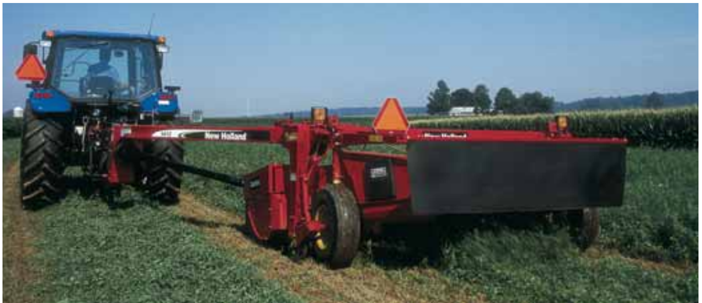
Adjustable header flotation springs and on-the-go cutting angle adjustment allow you to get all the crop without scalping or knife damage.