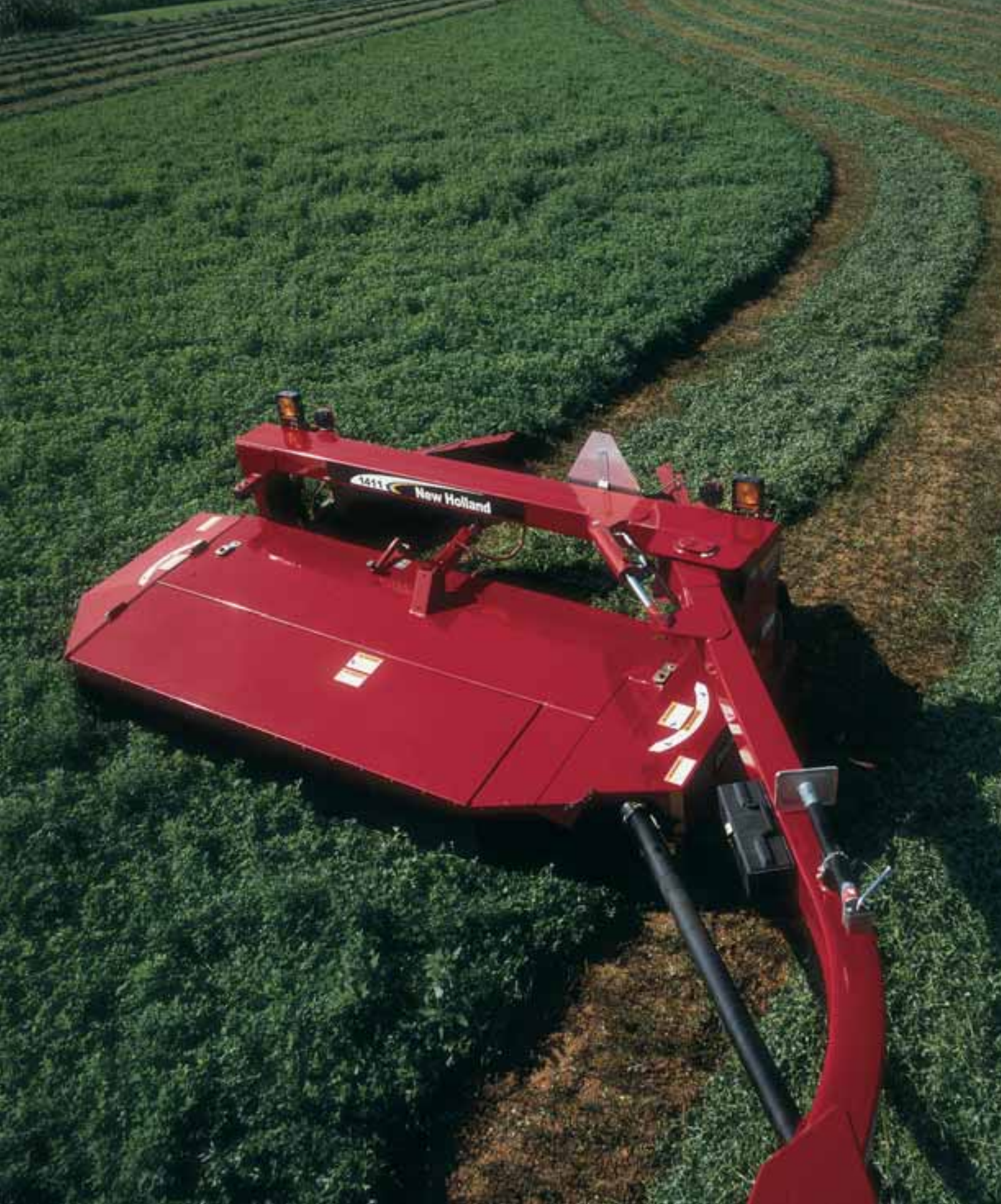
The Discbine header is suspended independently of the trail frame, allowing it to react both vertically and laterally to changing ground contours.