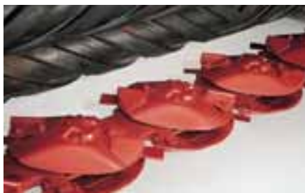
Two heavy-duty knives on each disc spin at 3,000 rpm for fast cutting without plugging.

Because each disc module is an individually sealed gear case, and because